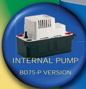
INTERNAL PUMP BD75-P VERSION