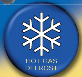
HOT GAS DEFROST

RUGGED • RELIABLE • PRACTICAL • VALUE FOR MONEY